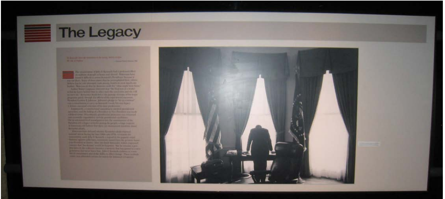
Cover photos (clockwise from top left): ;.