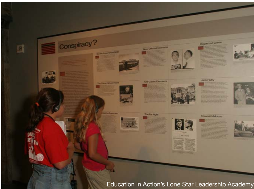
Education in Action's Lone Star Leadership Academy

19. Why do you think many people believe President Kennedy's death was part of a conspiracy (a secret plot carried out by multiple people)?