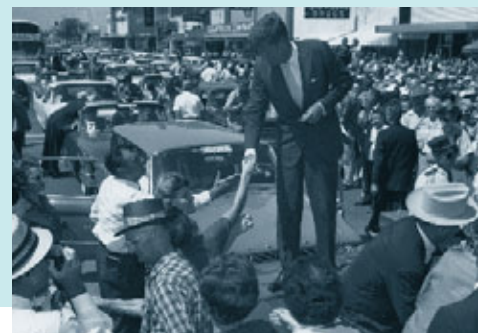
Left: Frank Muto, photographer, Gregory Clock Collection/The Sixth Floor Museum at Dealey Plaza; Right: Dallas Times Herald Collection/The Sixth Floor Museum at Dealey Plaza