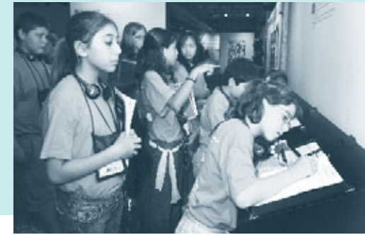
Both: Courtesy Education in Action's Lone Star Leadership Academy