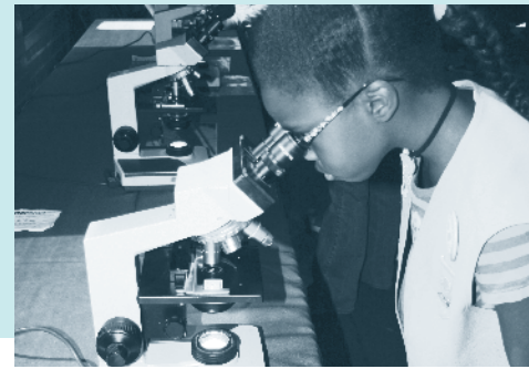
Right: Courtesy Education in Action's Lone Star Leadership Academy